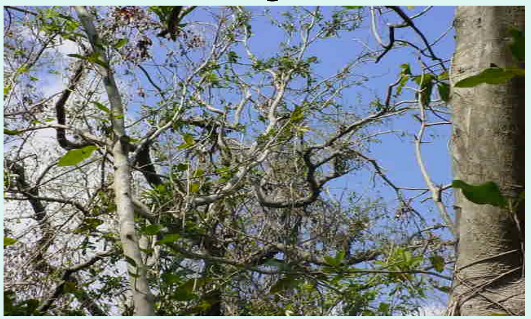
Find the hanger! Is it eligible?