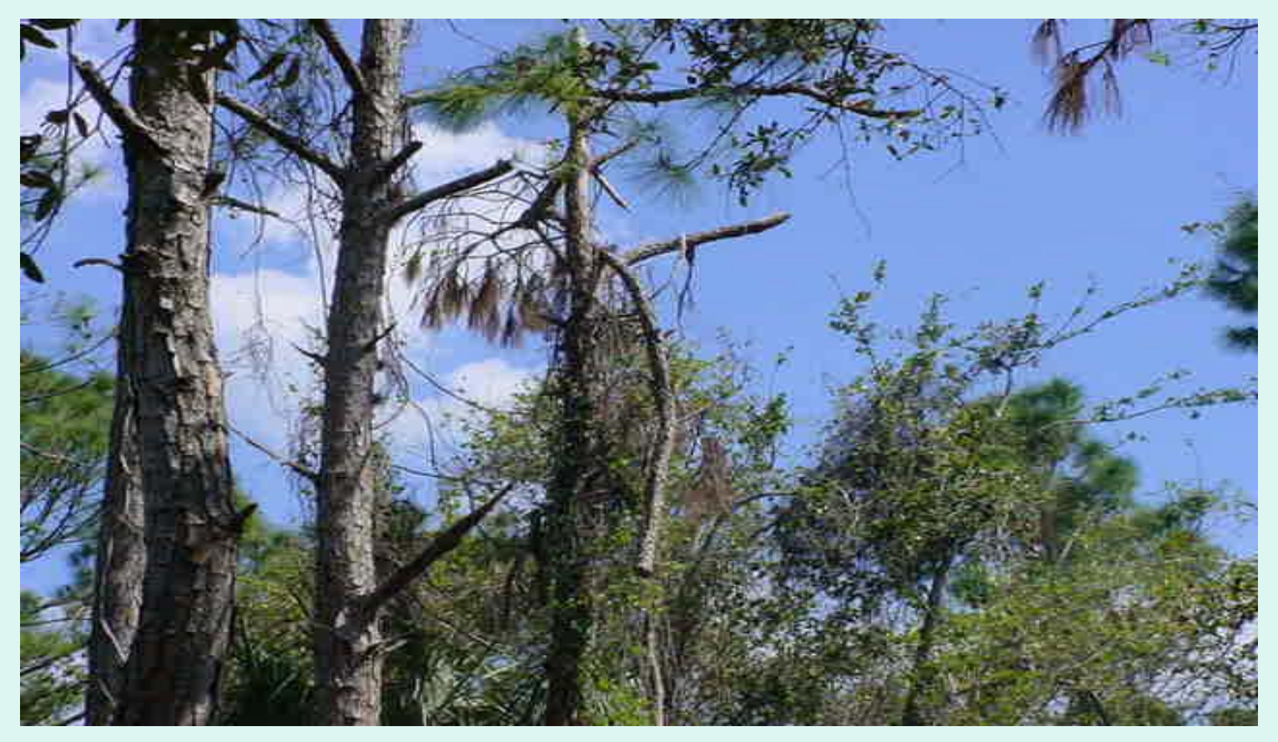
Find the hanger! Is it eligible?